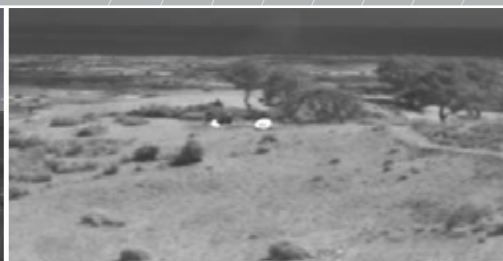
• Fire detection