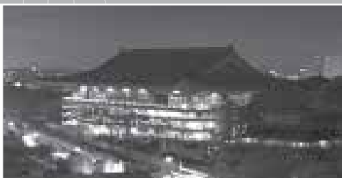
• Night vision